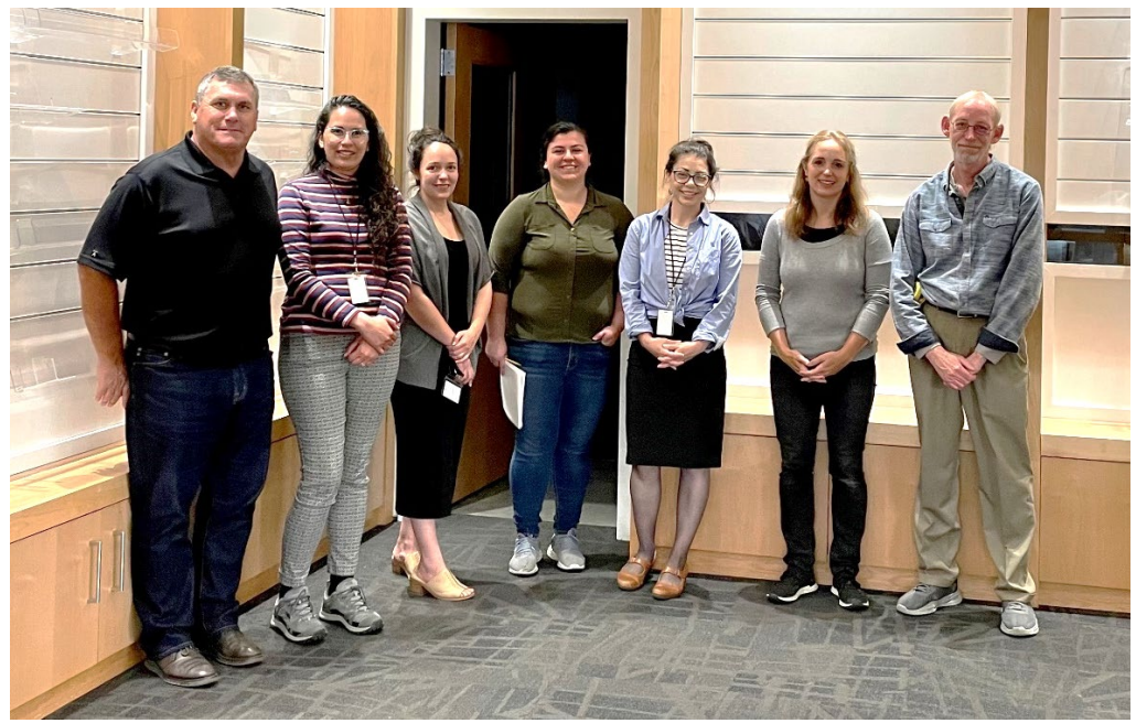
Formations team members (on each end) gather with LAM staff in the existing gift store space during a site visit in June 2023. The gift store closed in 2020 during the COVID-19 pandemic and has remained empty since then.

The Division of Alaska State Libraries, Archives & Museums is excited to share that the prior gift store space in the Andrew P. Kashevaroff Building is being re-envisioned as a children's exploration center. The center is conceived as a place to promote lifelong learning among young Alaskans with a focus on early literacy and hands-on exploration of the state's unique history, culture, and art. LAM has contracted with Formations, Inc. out of Portland for planning, design, and fabrication of the children's center. The planning team includes a terrific roster of staff from the Alaska State Libraries, Archives & Museums as well as strategic partners from Sealaska Heritage, Discovery Southeast, and Juneau School District.